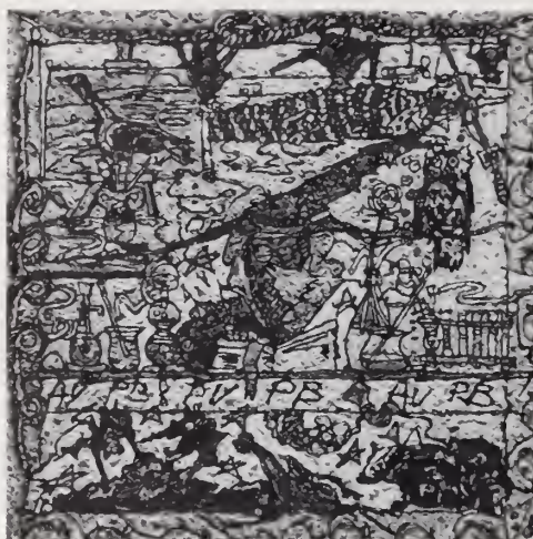
Joe Zucker, Merlyn's Lab , 1977

Within the designation of all art after 1970 as Post-Minimal, the work of these New Image artists can be called pre-expressionist. They still relied on calculated aesthetic strategies to contain intense states of being and self-concerned subjects. A single image dominated the work, and its complexity resided as much in the method of execution as in its